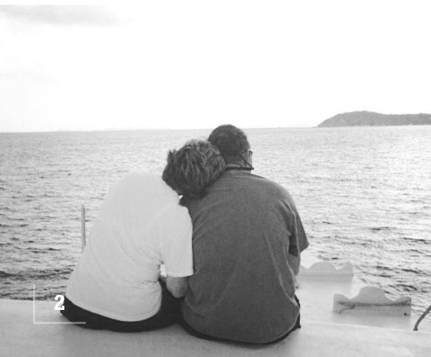
Photo submitted by Pam from Texas , Great American customer since 2003.

Great American. It pays to keep things simple. ®